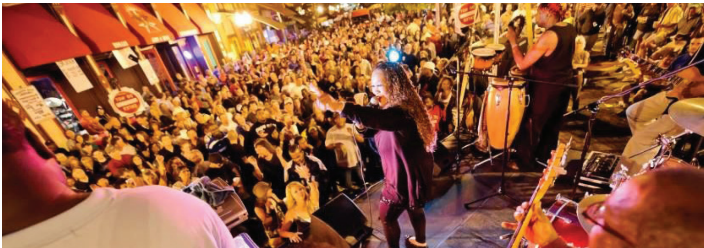
Coalition at Crown Royal's Big Muddy.