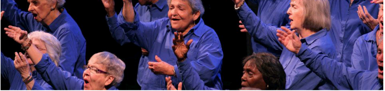
Young@Heart Chorus, explore their concert footage on YouTube