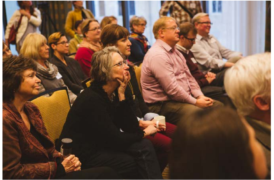
Our Seeding Vitality Arts U.S. cohort listens intently during last October's convening.