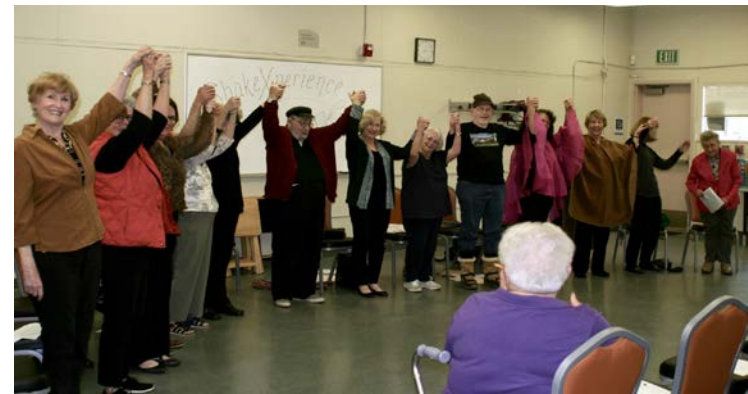
The Camden cast takes a bow after their performance. © SV Creates