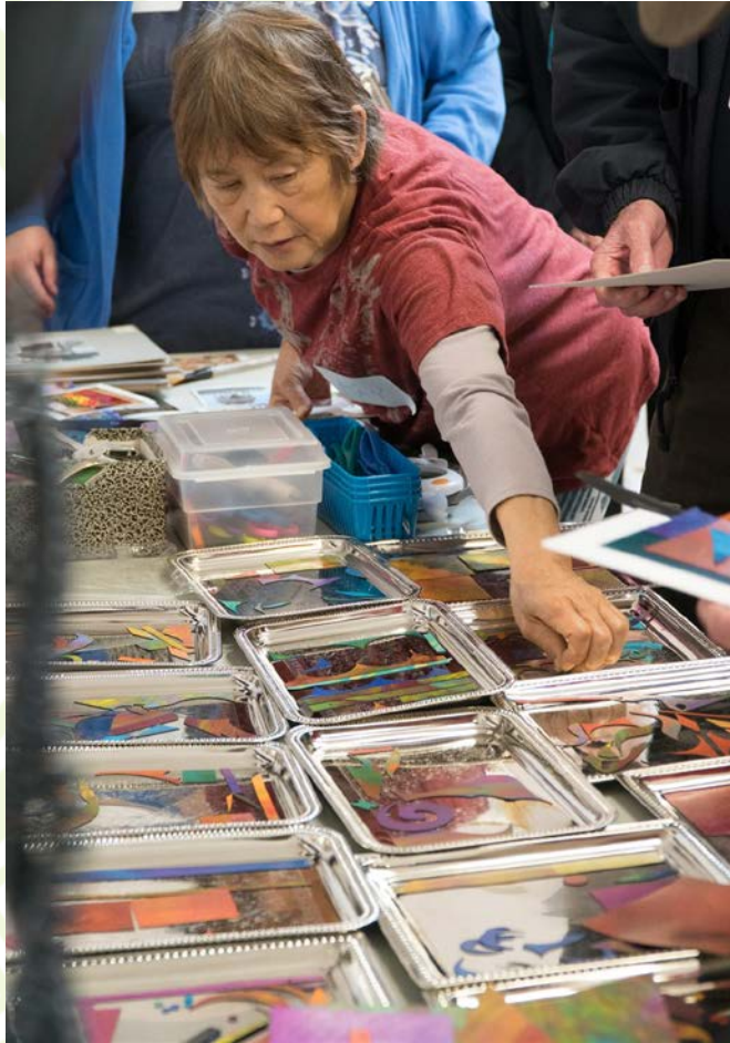
A student of Experience Arts points to her artwork.