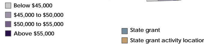
TOTAL POPULATION, AWARDS AND ACTIVITY LOCATIONS, AND GRANT DOLLARS BY INCOME LEVEL