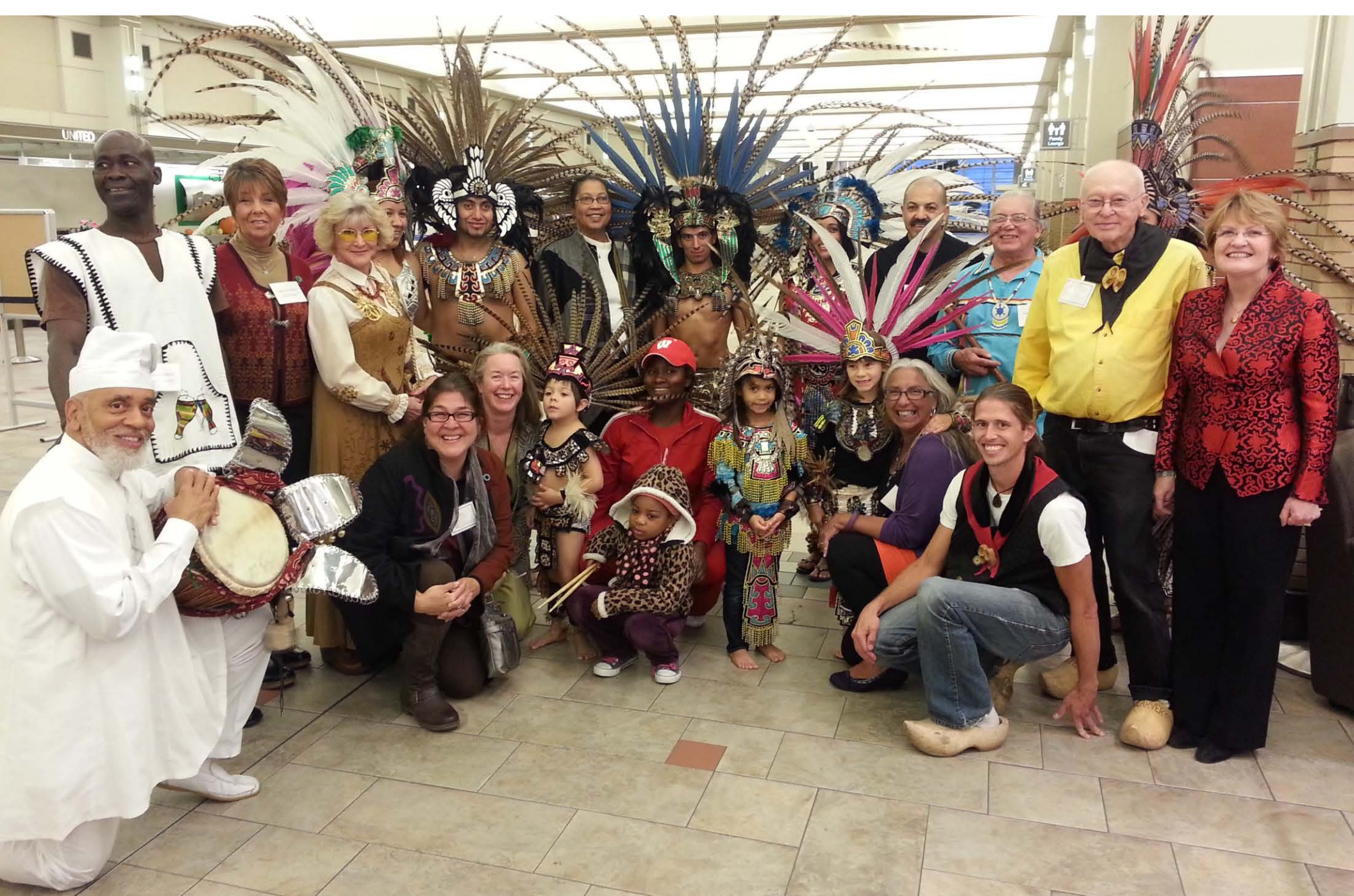
Folk arts masters and apprentices showing & performing at the Dane County Airport gallery space