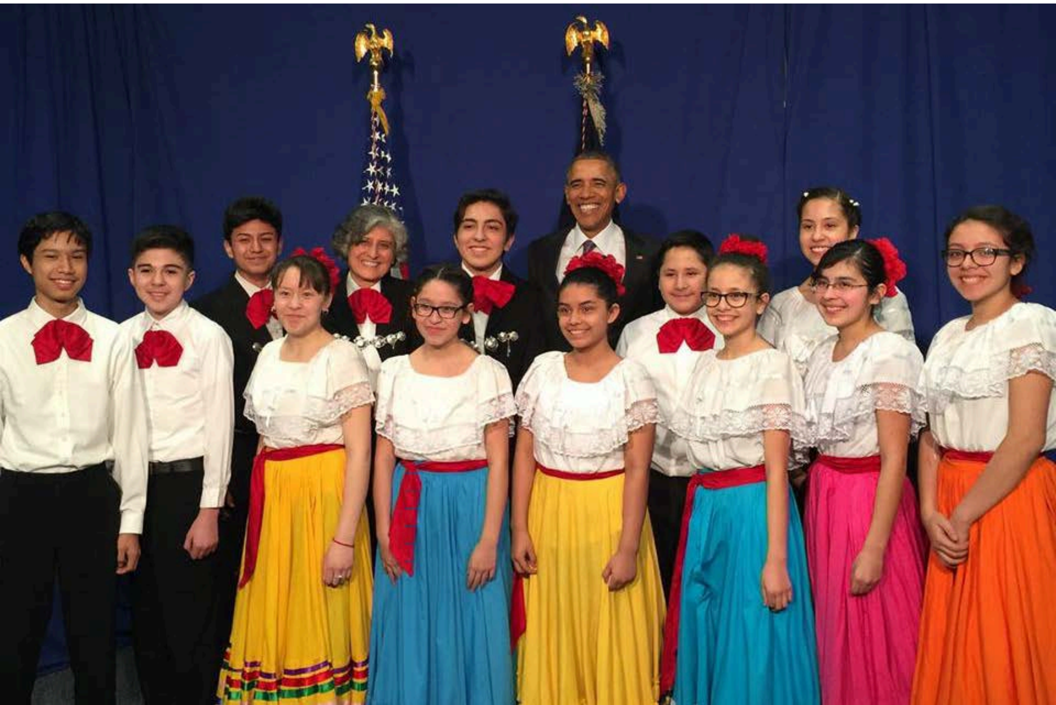
Latino Arts Strings Program with President Barack Obama Milwaukee, 2016