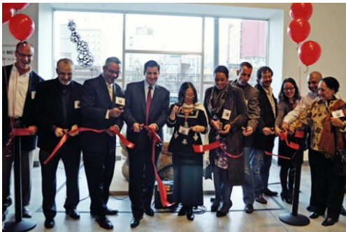
Asian Arts Initiative