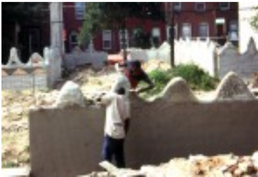
Village of Arts & Humanities