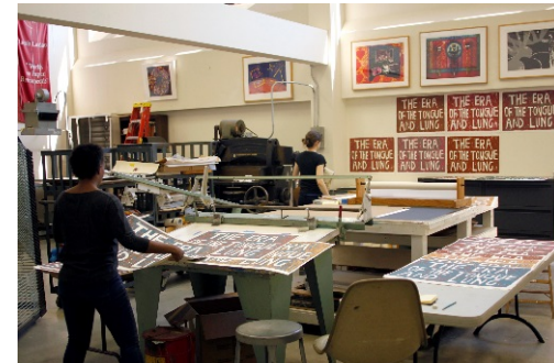
Brandywine Graphic Workshop and Archives