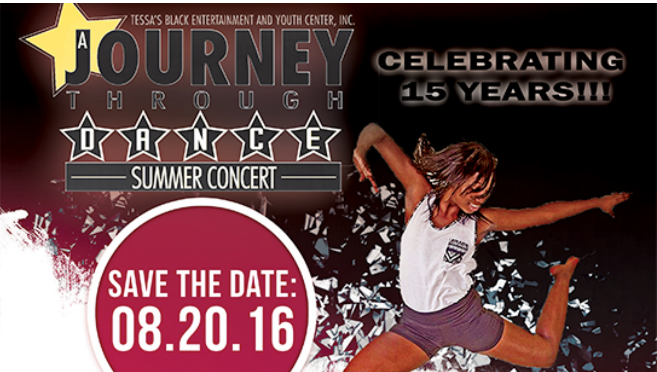
Tessa's Black Entertainment for Youth Company (TBEY)