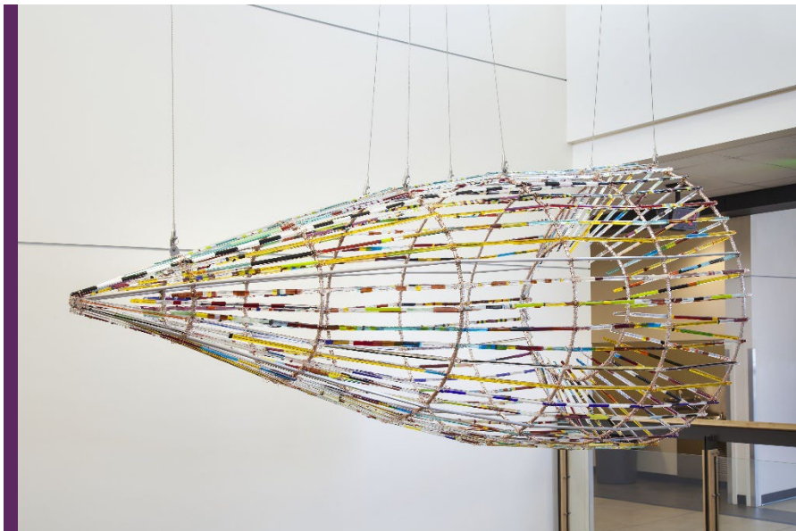
Artist Joe Feddersen's Plateau Fish Trap is inspired by the fish traps of the Plateau Native people of Eastern Washington. It celebrates ingenuity, architectural beauty, and a historic relationship to the land and fisheries. Located at Spokane Falls Community College, Spokane. Part of Washington's State Art Collection

More than a quarter of the states with active percent for art programs have policies requiring or specifying preference for state or region based artists for percent for art projects.