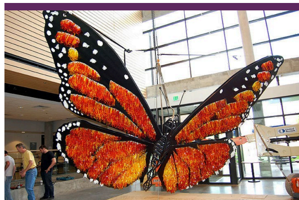
Psyche (the butterfly) by Donald Lipski, located at the Auraria higher education center. This work is part of the Colorado percent for art collection.

Percent for art installations tend to require more maintenance than other artworks because they are sited in public spaces, which tend to have high pedestrian or vehicle traffic. In addition to the risks of integrating art into the flow of daily life is the damage caused by atmospheric conditions, especially when projects are sited outdoors. The necessary routines of inspecting and maintaining percent for art installations can be expensive and time-consuming, and therefore a strain on budgets and staff. Though some states have policies allocating a portion of percent for art funds to cover maintenance costs, those set-asides are not guaranteed to be sufficient. And while other states don't task their arts agency with maintenance responsibilities, these agencies may face the challenge of having to enforce percent for art maintenance protocols that are being ignored due to lack of expertise or willingness.