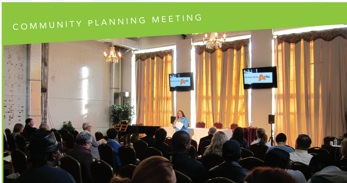
Opera Delaware Studios, Wilmington