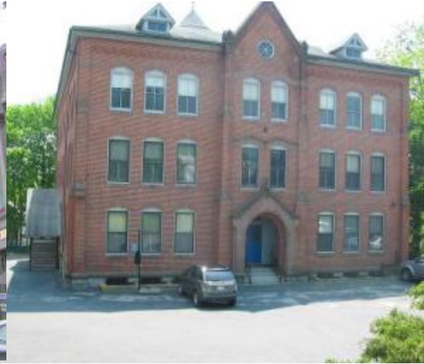
North Adams Ayer