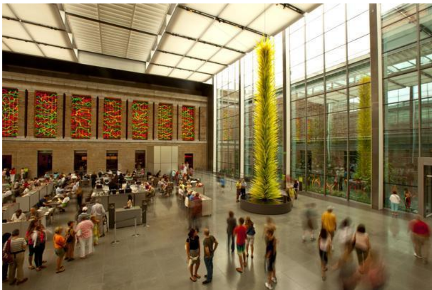
2011 FILE PHOTO/ERIK JACOBS FOR THE BOSTON GLOBE

Museum of Fine Arts Shapiro Family Courtyard.